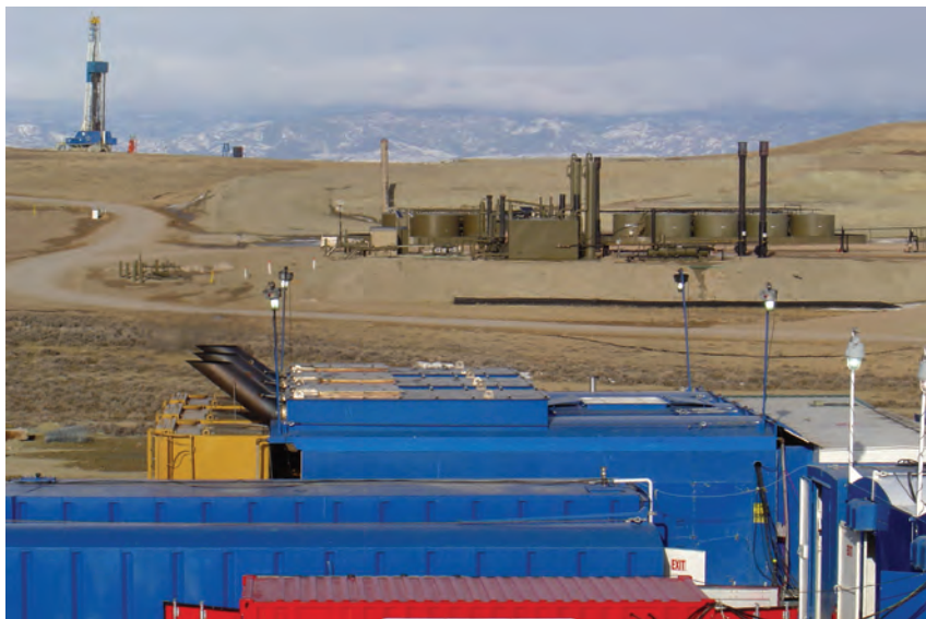
The most recent installation of CleanAIR's new E-POD was on seven Caterpillar 3512 diesel generator sets units operating on drill rigs in Wyoming's Pinedale Anticline Project Area (PAPA).

catalyst with the company's wall-flow Permit Filter or Assure diesel oxidation catalyst (DOC).